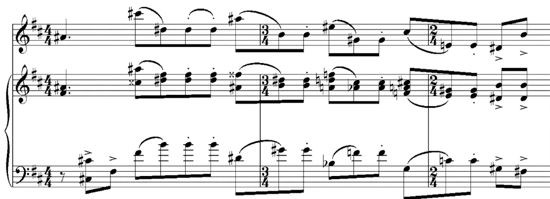
Ex. 1. Sonata Breve for Violin and Harpsichord , Mvt. I, mm. 43–45

Other trademarks of the “Rieti style” include the displacing of rhythmic accents to weak beats of a measure, creating shifting barlines and meters. The following example from the Sonata Breve is representative: