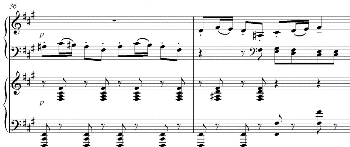
Ex. 4. Triptych for Two Harpsichords , Mvt. I, mm. 36-37

The first movement opens with an Andante tranquillo in 6/8 that will also be heard, transposed, as a ritornello at the beginning of the other two movements. Harpsichord I then plays a jaunty passage in sixteenth notes accompanied by idiomatic repeated thirds in Harpsichord II. This material, which dominates this movement, will sometimes devolve into comic sections in which a jolly melody is accompanied by the type of vamping chords one might hear in a Parisian café: